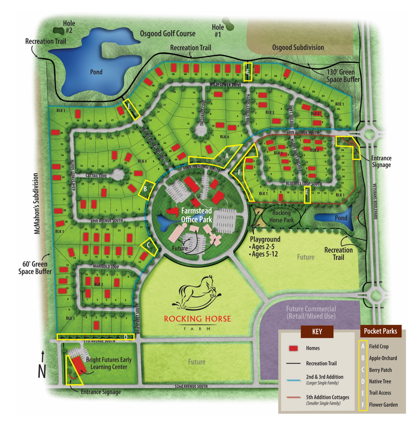
Rocking Horse Farm 5<sup>th</sup> Addition HOA – November 10, 2020

Common areas managed and owned by the RHF Residential HOA are defined with a yellow outline. These areas include 4 learning-oriented pocket parks, 2 entrance signs and their landscaped lots, and 3 trail access lots. It's expected that a 5th pocket park, Flower Garden, will be installed in late 2020.